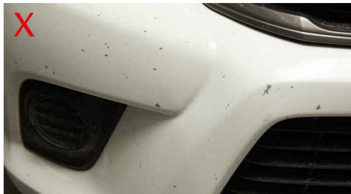
Excessive stone chipping