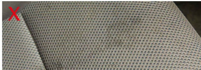
Staining to seat