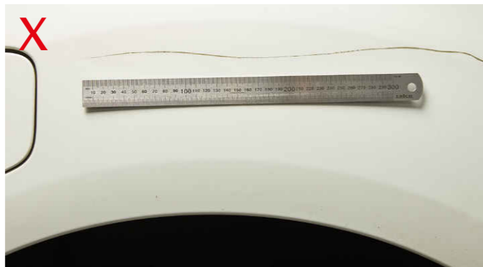
Scratch longer than 25mm long

Damage to paint finish through caustic substances or environmental forces that cannot be polished out is not acceptable. Any decals or signwriting must be removed prior to the vehicle inspection being completed. Damage due to the removal of decals or signwriting is not acceptable. Excessive stone chipping is not acceptable.