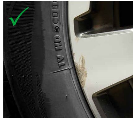
Minor scuff to wheel