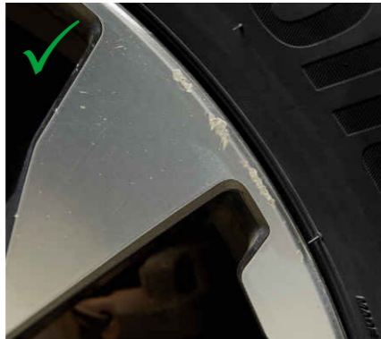
Minor scuff to wheel