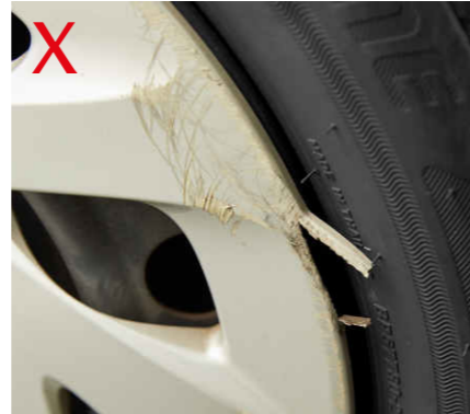
Cracked wheel trim