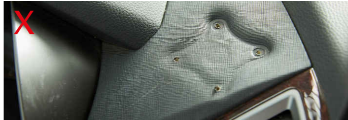
Holes in trim

Unpleasant odours which require specialist cleaning to remove are not acceptable (such as pet or cigarette/vape odours).