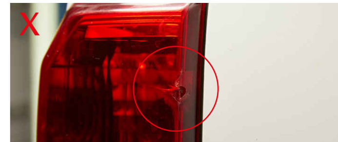
Cracked light cover

All lights and lamps must be operational. Minor scuff marks or scratches up to 25mm are acceptable. Holes or cracks in the glass, plastic covers or lamp units are not acceptable.