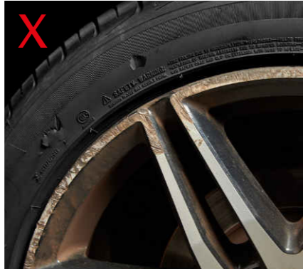
Excessive damage to wheels

If mud flaps are standard equipment, they must be intact and properly attached. The jack and appropriate wheel tools must be stowed properly and in good working order. Spare wheels or alternatives must be identical to those originally supplied with the vehicle and in operational order.