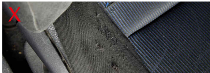
Excessive wear or rips in upholstery